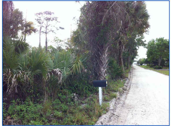
Looking South along 10 th Ave, Subject Site on left