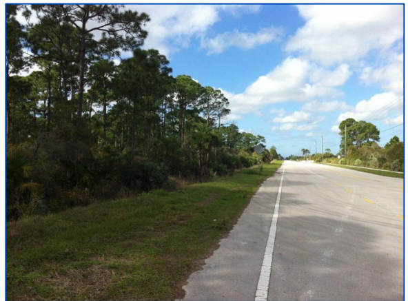
Looking West along 5 th St SW, Subject Site on left