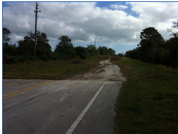
Looking East along 5 th St SW, at planned entry across from Serenoa PUD