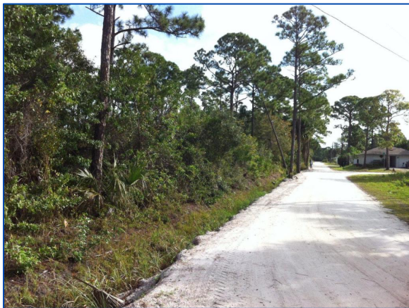
Looking East along 7 th St SW, Subject Site on left