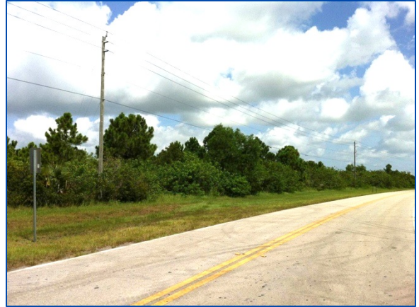
NW EAST TORINO PARKWAY LOOKING NORTHWEST (SITE ON LEFT)