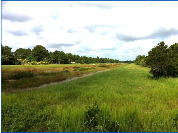
SOUTHERN PROPERTY BOUNDARY (SITE ON RIGHT)

561.988.5890 SOUTHEAST ASSET SPECIALISTS, LLC