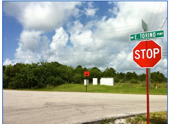
NE CORNER OF SITE AT TORINO/DELWOOD INTERSECTION