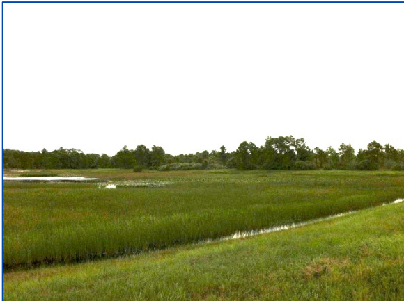
PICTURESQUE PRESERVE ON SITE'S WESTERN BOUNDARY